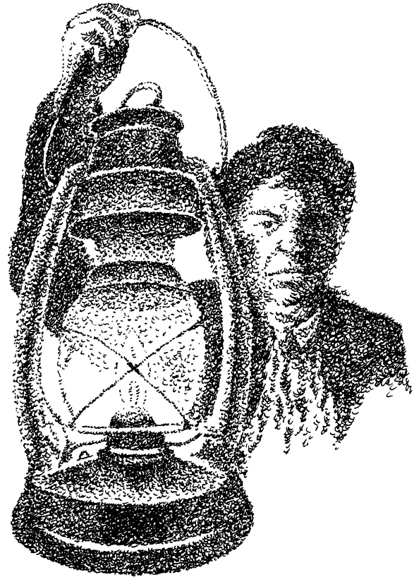
Illustration © 2026 Dan Kirchoff

We invite you to take an active role in crafting our retreat experience. Lead a workshop that resonates with your personal journey and interests, contributing to a program that reflects our community's collective wisdom.